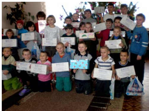
Children at an Orphanage, receiving gifts at Christmas.